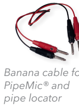
Banana cable for PipeMic® and pipe locator