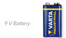
9 V Battery